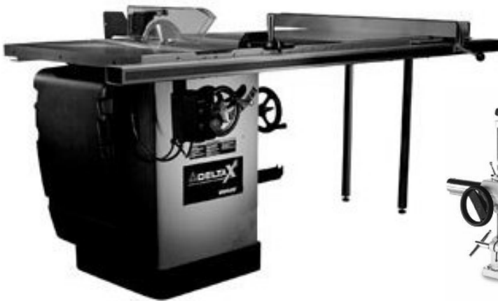
36-L31X-BC50 Delta X5 3 HP Left Tilt Unisaw with Biesemeyer Fence