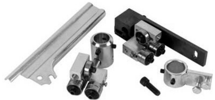
28-198 - Roller Guides