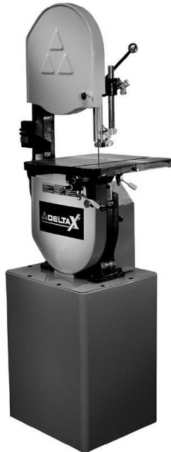
28-475X 14" Band Saw with Enclosed Stand