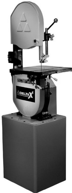
28-475X 14" Band Saw with Enclosed Stand