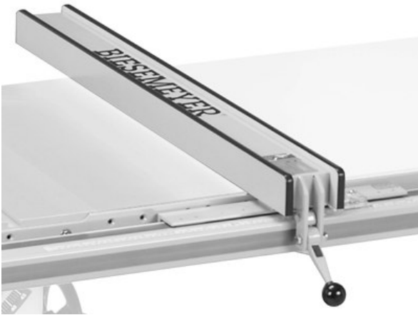
BC30 - Biesemeyer Commercial 42" Fence with 30" Rail BC50 - Biesemeyer Commercial 42" Fence with 50" Rail