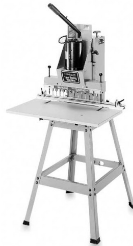
32-325 Line Boring Machine