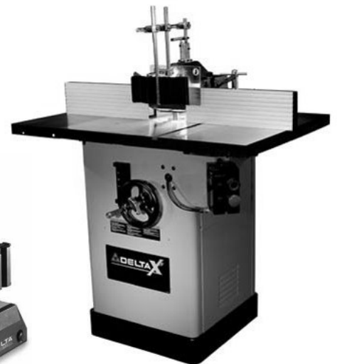
43-495X Delta 5X 3HP Heavy-Duty Shaper

In addition to Delta tools, we also have access to their Full Line of Accessories and Bench Tools, most of which we carry on hand. Please call 1-800-288-7483 for pricing and availability.