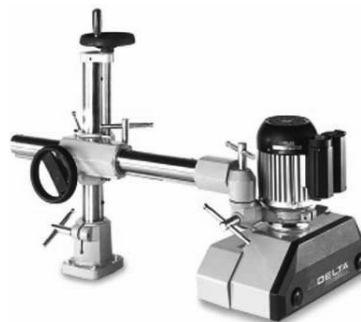
36-851 Production Stock Feeder