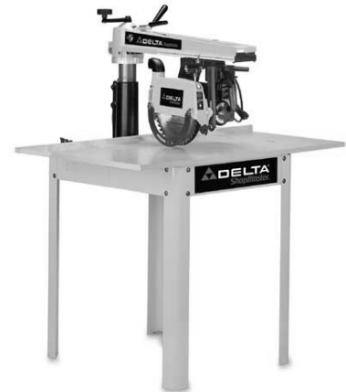
RS830 10" Professional Radial Arm Saw