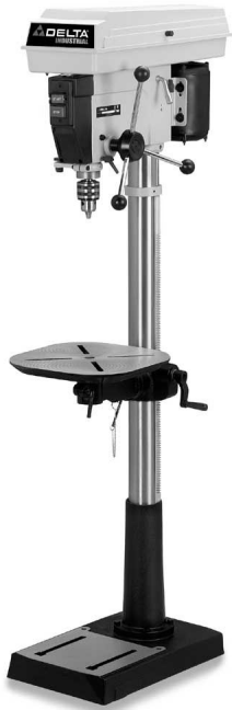
17-965 Industrial Drill Press

We are a full-line Delta distributor, stocking many machines and equipment. Delta has frequent promotions and sales on their equipment, so in order to stay up to date on prices and inventory please call Ballew Saw & Tool, Inc. 1-800-288-7483 .